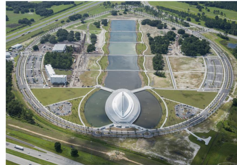
Florida Polytechnic University 8-14-14

Academic Offerings: 2 Colleges that offer 6 Baccalaureate programs, 2 Master's programs and 19 areas of concentration