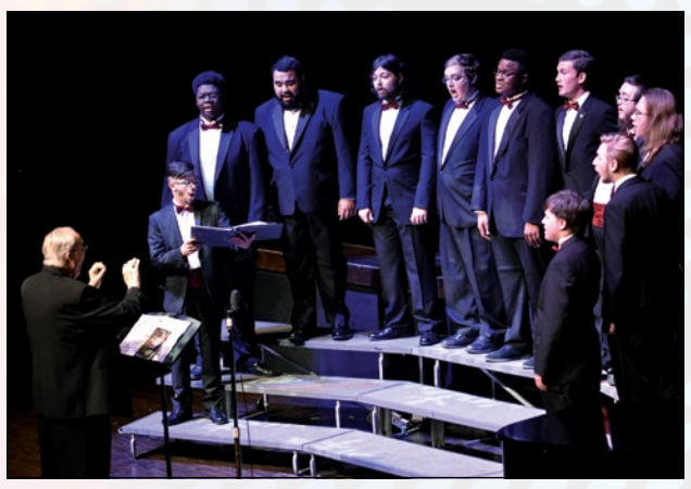
2016 Polk State Choir performance

CHAMBER MUSIC SERIES "Trimurti: The Power of 3" Presented by Voices of the People Polk State Lake Wales Arts Center