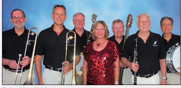
The New Orleans Nighthawks