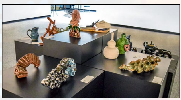
Polk State Arts Day 2016 - Student Artwork

Polk State Winter Haven Fine Arts Gallery